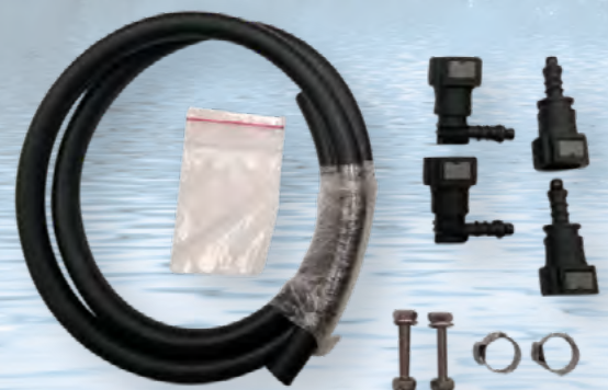
Hose and fittings (incl. in installation kit)